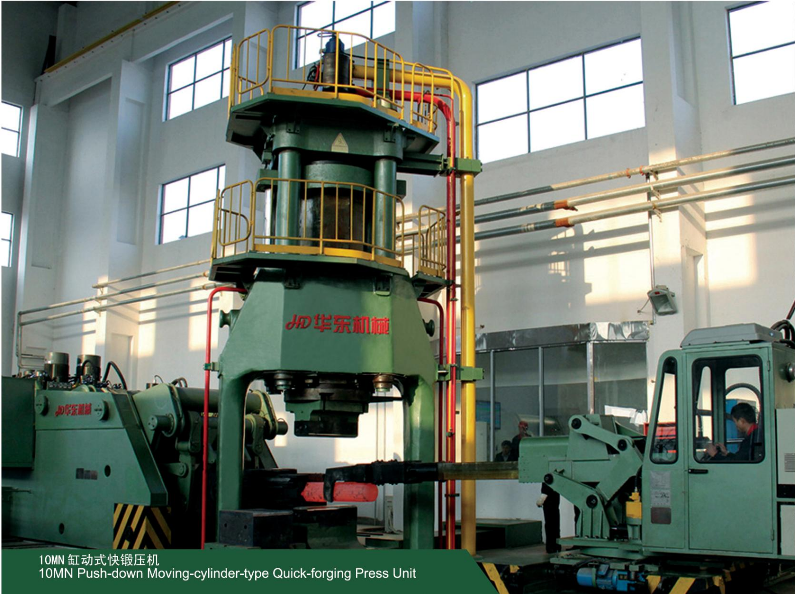
10MN 缸动式快锻压机 10MN Push-down Moving-cylinder-type Quick-forging Press Unit