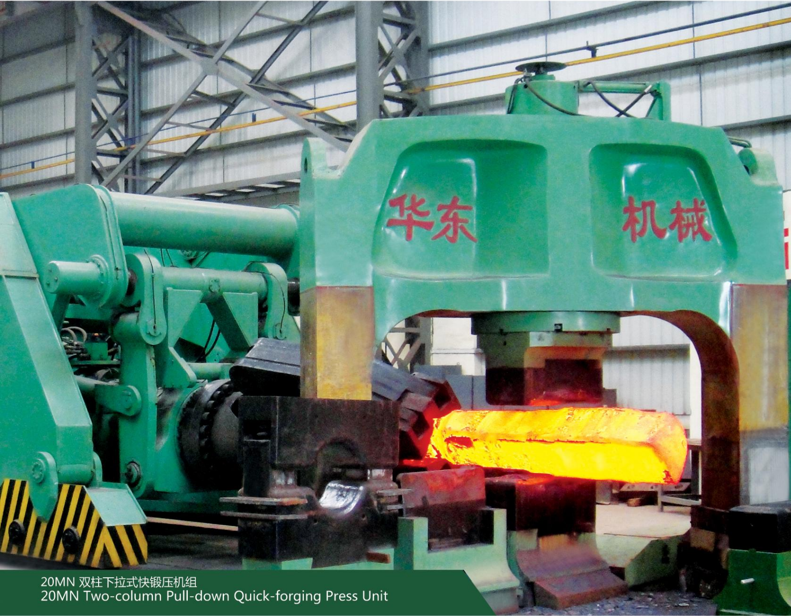
20MN 双柱下拉式快锻压机组 20MN Two-column Pull-down Quick-forging Press Unit