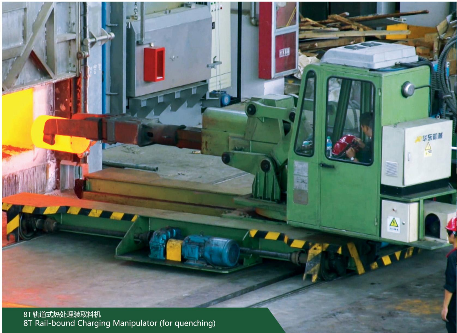
8T 轨道式热处理装取料机 8T Rail-bound Charging Manipulator (for quenching)