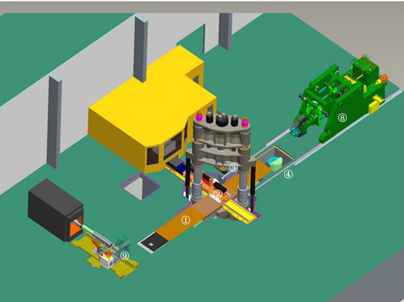
生产线设备布置图the layout of the equipments on production line