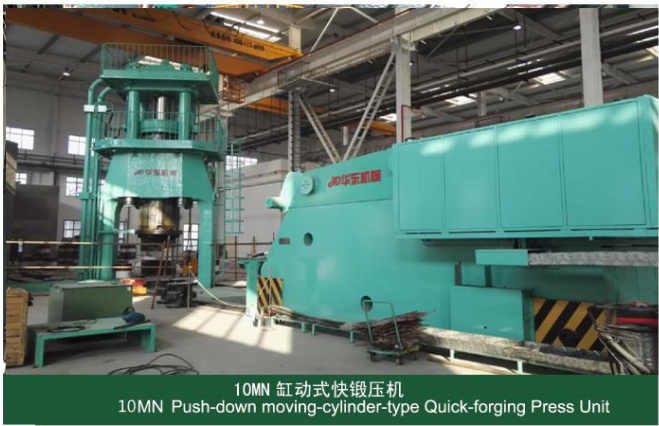
10MN 缸动式快锻压机 10MN Push-down moving-cylinder-type Quick-forging Press Unit

The host structure is single cylinder, whole pre-stressed frame, double column and moving-cylinder type, and owns three technical patents which is 1.2 times contrasting with conventional quick-forging unit; The forging accuracy can reach \pm 0.5\text{ mm} . Energy efficiency is high, and it can save 10% to 15% energy. The basic expenses are low, just about 30% of same tonnage pull-down quick-forging Press.