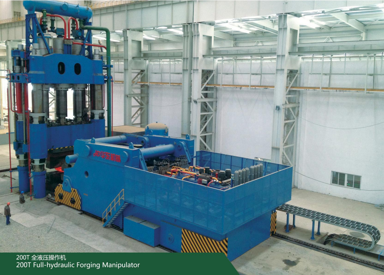
200T 全液压操作机 200T Full-hydraulic Forging Manipulator