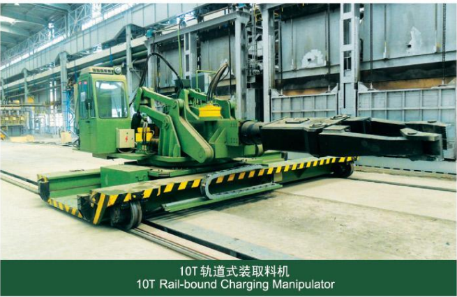
10T 轨道式装取料机 10T Rail-bound Charging Manipulator