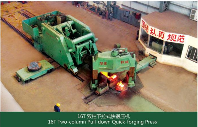
16T 双柱下拉式快锻压机 16T Two-column Pull-down Quick-forging Press

Two-column Pull-down type structure causes low center of gravity, provides bigger eccentricity and better stability. Working cylinder located under the ground, shortened its distance with the valve station, lowered vibration. "Human-familiar operating environment"helps extend the productivity.