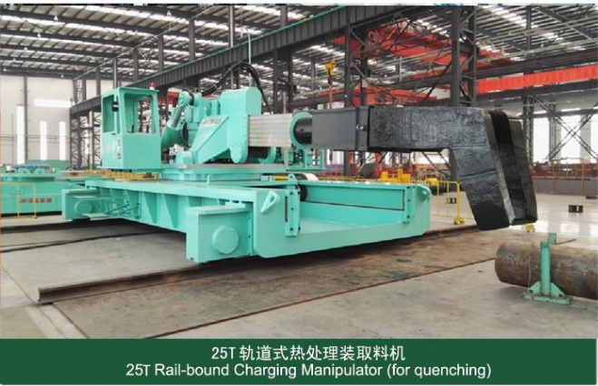
25T 轨道式热处理装取料机 25T Rail-bound Charging Manipulator (for quenching)

This manipulator is designed according to the production process in the workshop and site layout. It is suitable for high-temperature environment, acts quickly, and has high efficiency. The Heat-treatment Charging Manipulator can realize the control of produce rhythm to ensure the discharging and the quenching time are consistent. Its operation and maintenance are convenient.