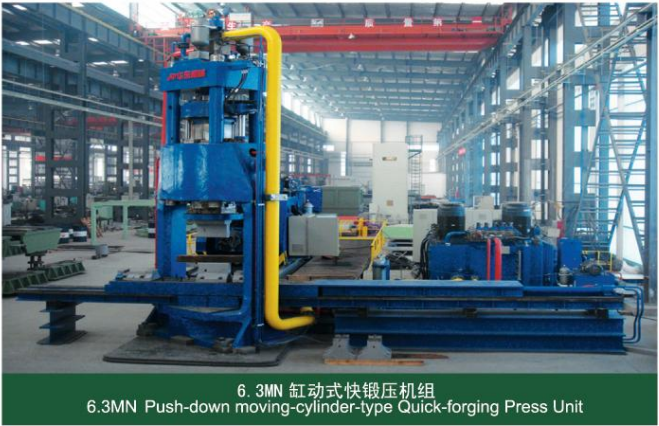
6.3MN 缸动式快锻压机 6.3MN Push-down moving-cylinder-type Quick-forging Press Unit