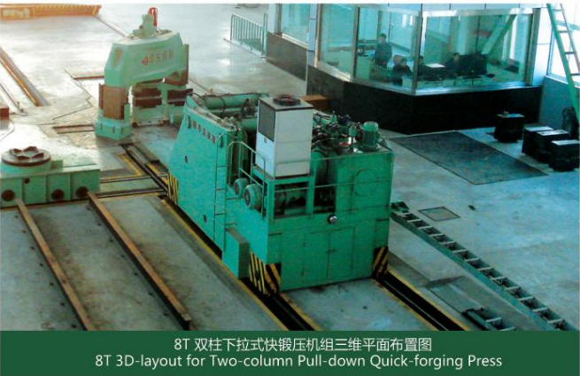
8T 双柱下拉式快锻压机组三维平面布置图 8T 3D-layout for Two-column Pull-down Quick-forging Press